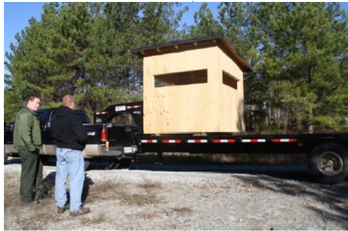
Richard B Russell/Outdoor Dream Foundation Hunting Blinds